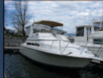
38' CARVER 1996 T/454 EFI $79,900