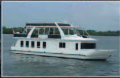
82' X 21' FANTASY 2008 T/315hp Yanmars $539,000

Our annual Spring In-Water Boat Show is coming up April 9-10. You can see our complete inventory at www.greenturtlebayyachtsales.com