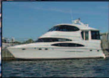
50' CARVER 2001 T/450hp Cummins $249,000