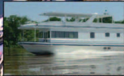
70' X 17' DARLING 2010 T/600hp Cummins $694,000