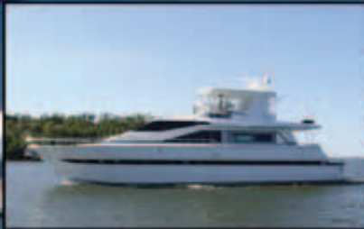
76' AZIMUT 1989 T/1050hp MAN Diesels $499,000