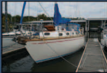
37' NAN TAI 1982 S/35hp Volvo Diesel $47,500