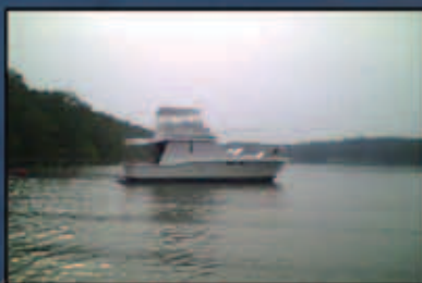
32' TROJAN 1978 T/260hp Chryslers $29,900