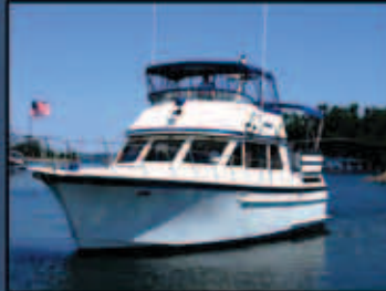
42' JEFFERSON 1985 T/Perkins $89,000