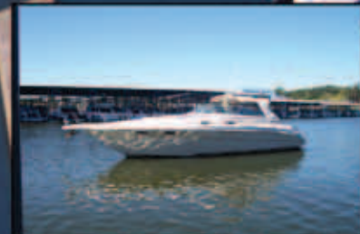
33' SEA RAY 1999 T/454's $69,900