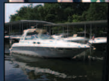
31' SEA RAY 2002 T/350 Mercs $89,900