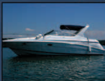
32' CHRIS CRAFT 1999 T/5.7L Volvo $59,900