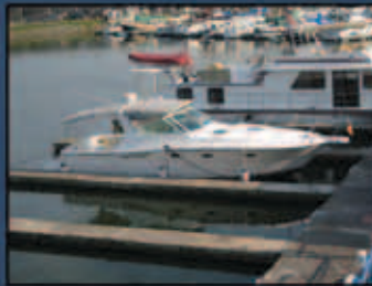
35' TIARA 2001 T/8.1 Crusaders $129,000